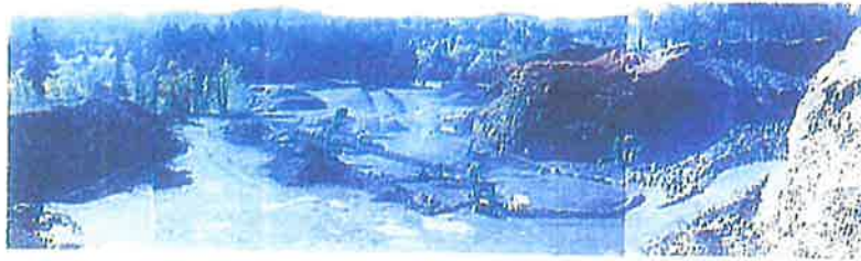
LOOKING SOUTH AT PROCESSING PLANT AND DOT PARCEL

Geologic field evaluation of all Burlington Northern Railroad subsidiary company lands in the northwest States of Idaho, Oregon, and Washington for the purpose of determining the occurrence, quantity and quality of sand & gravel and bedrock aggregate sources on BNRR land. The project spanned 18 months from June, 1987 through December, 1988, and involved 2,040 hours of geologic services. June and July of 2003, geologic reconnaissance of Plum Creek Timber Company ownership in Kalispell and Missoula region of Montana to evaluate the bedrock formations in terms of their value in the decorative rock and dimension stone industry.